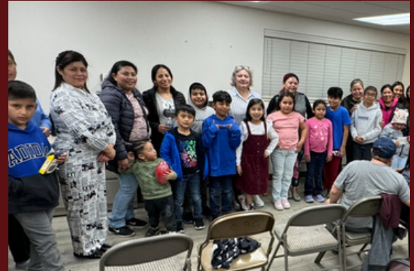
One of our well-attended Guiding Good Choices sessions at our CBC location in Midvale.

One of our most recent and very successful programs has been "Guiding Good Choices", which is a mental health program that provides emotional support groups for parents. This youth substance-prevention program engages both youth and their parents in ongoing community classes, providing mental, emotional and behavioral support.